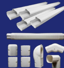
Line Cover Kit